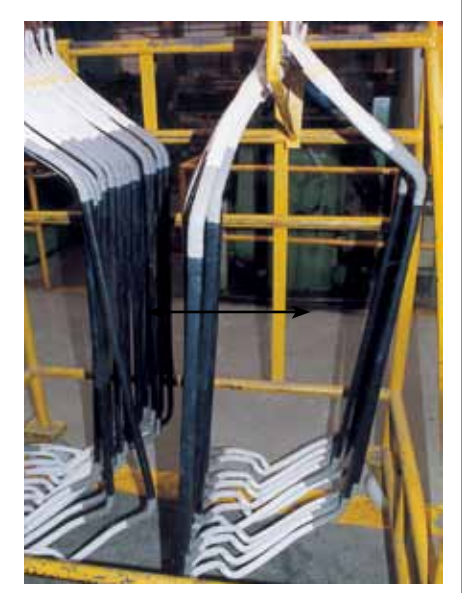
We recommend to protect them from heat, humidity and at an ambient temperature.